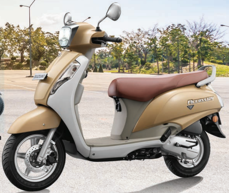
Access 125, Special Edition (Alloy Disc)