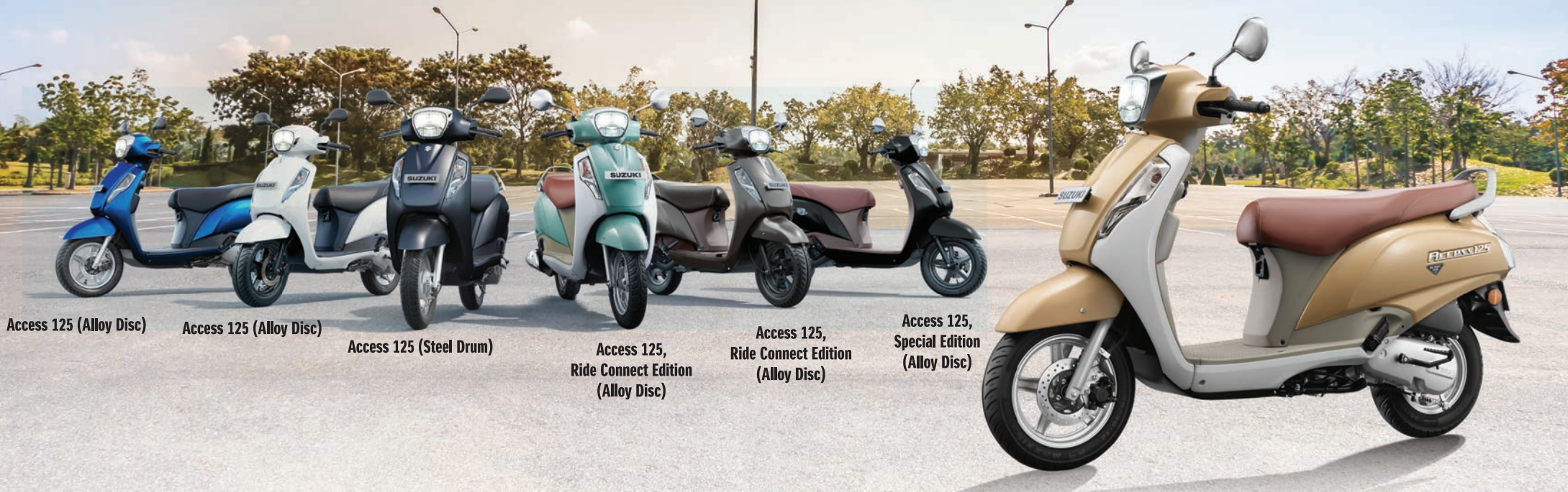
Access 125 (Alloy Disc)